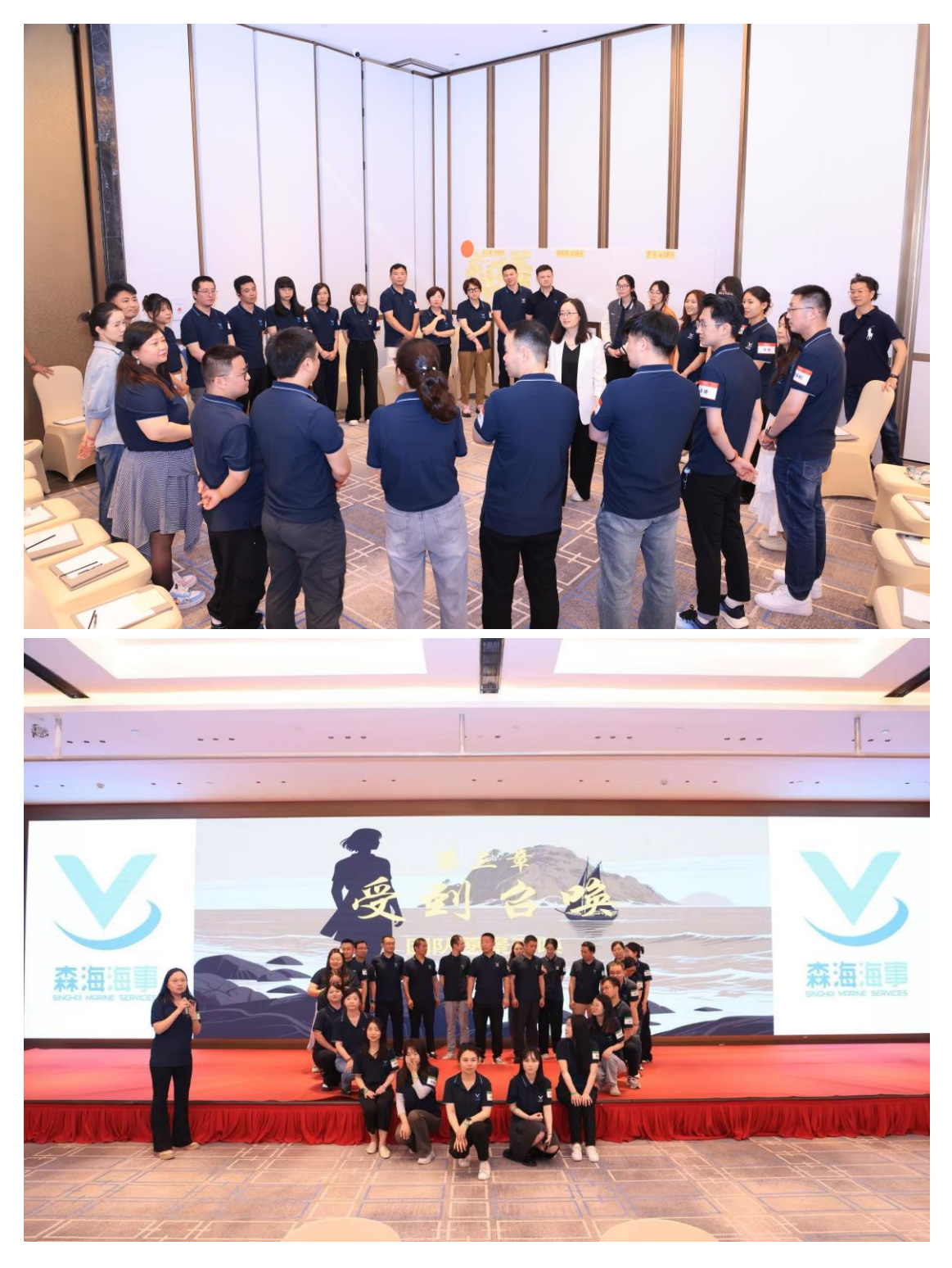
In the "Answering the Call" session, all participants co-created goals and shared visions, recording their aspirations.