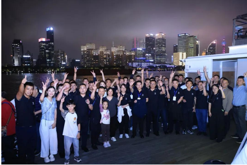
“Huangpu River Night Tour” for our senior officers and their families