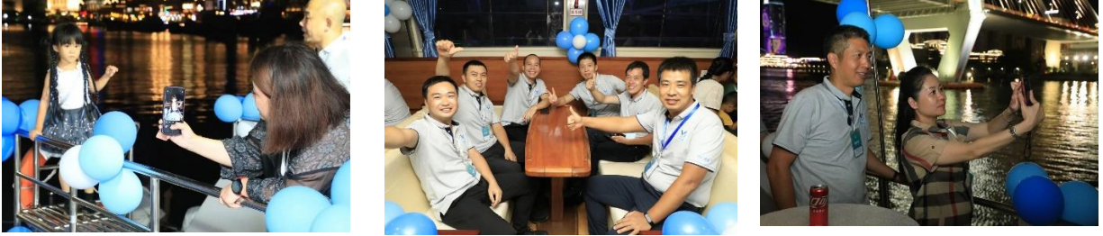
“Night Tour Haikou” for senior officers and their Families