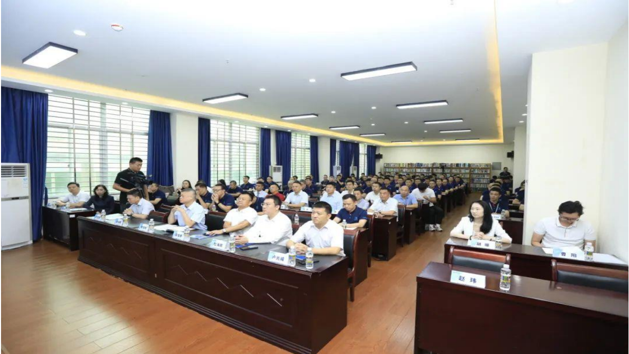
Official Opening Ceremony