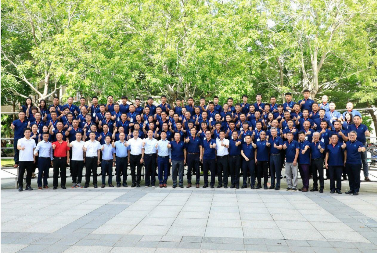
Singhai 11 th SOMC Group Photo

The theme of this year's Singhai SOMC is "Strengthening Leadership Skills in Sustainable Shipping". Topics presented include highlighting the importance of the shipping industry due to its increasingly prominence in tandem with the development of the global economy and the increase of trade activities. However, along with growth and development, the shipping industry also faces many challenges as we navigate towards the common goal of going green and managing the advent of smart shipping. To manage these developments and tackle these challenges, strong leadership is critical.