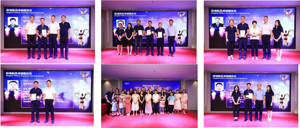
“Haikou Nite” appreciation dinner and outstanding senior officers award presentation